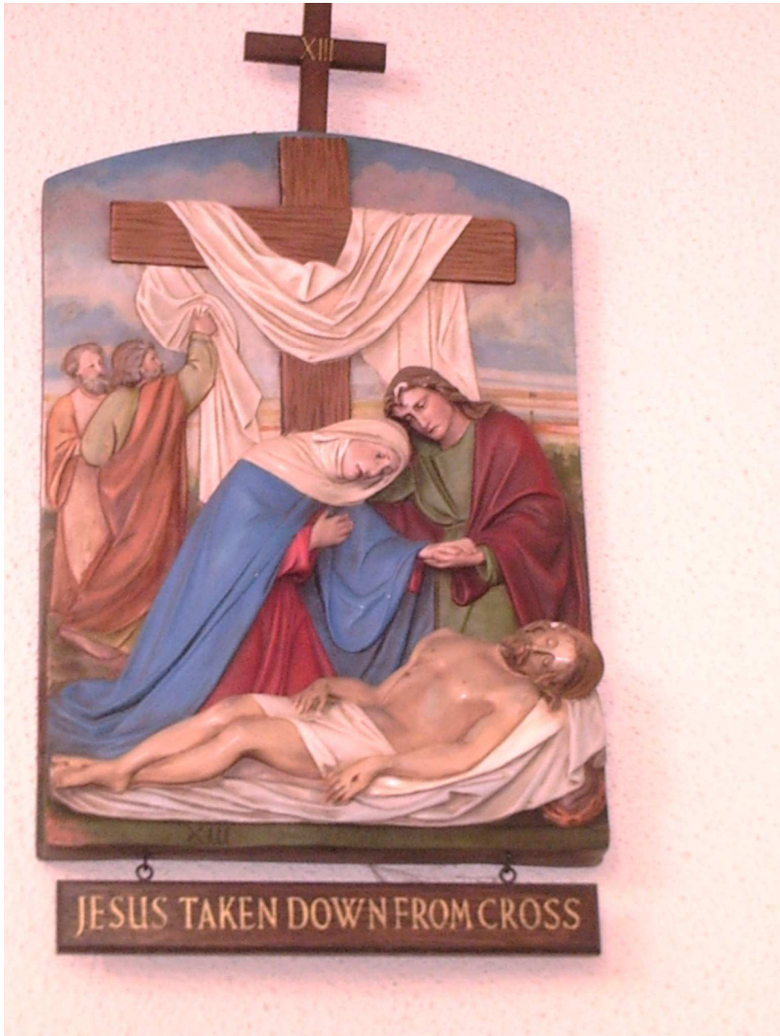
THE THIRTEENTH STATION OF THE CROSS