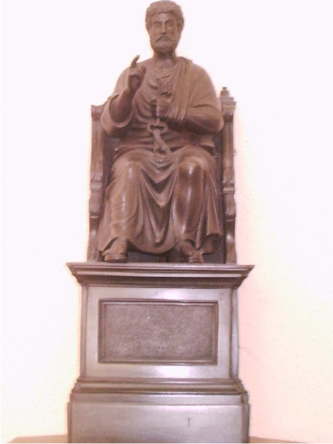
STATUE OF OUR PATRON SAINT ST.PETER